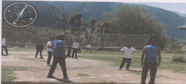
7W47+2PW, Srinagar - Ladakh Rd, 191202 Sat, May 02, 2026 Lat: 34.255226, Long: 74.914345 Author: VOLLEYBALL MEN Under NASHA MUKHT BHARAT AT GDC KANGAN