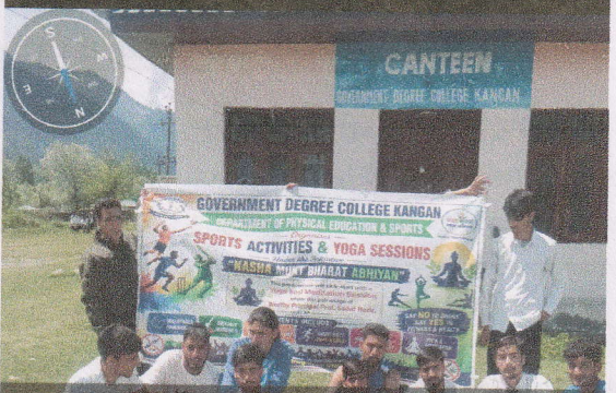
7W47+2PW, Srinagar - Ladakh Rd, 191202 Sat, May 02, 2026 Lat: 34.255226, Long: 74.914345 Author: VOLLEYBALL MEN Under NASHA MUKHT BHARAT AT GDC KANGAN

[Handwritten Signature] Principal Government Degree College Kangan