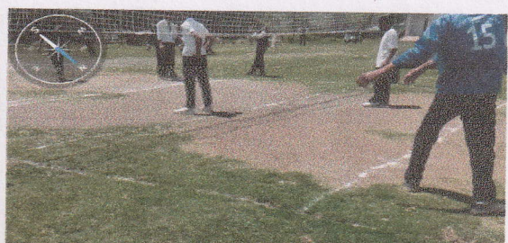
7W47+2PW, Srinagar - Ladakh Rd, 191202 Sat, May 02, 2026 Lat: 34.255226, Long: 74.914345 Author: VOLLEYBALL MEN Under NASHA MUKHT BHARAT AT GDC KANGAN