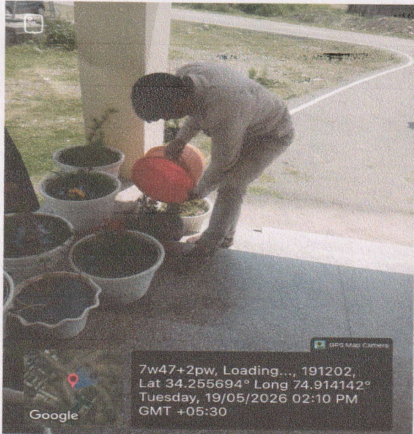
7w47+2pw, Loading..., 191202, Lat 34.255694° Long 74.914142° Tuesday, 19/05/2026 02:10 PM GMT +05:30