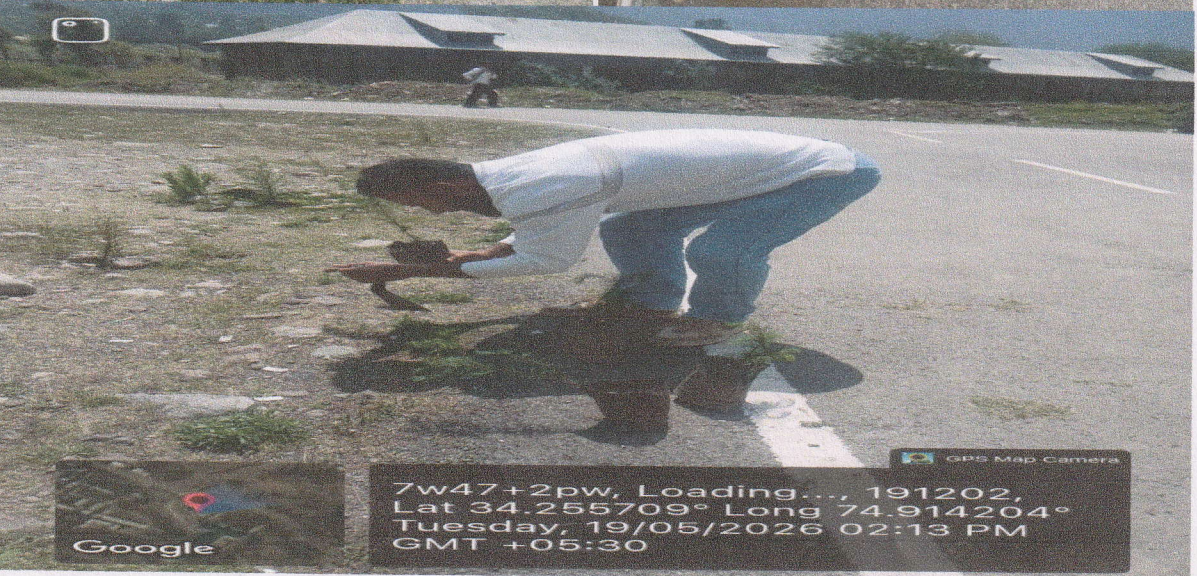
7w47+2pw, Loading..., 191202, Lat 34.255709° Long 74.914204° Tuesday, 19/05/2026 02:13 PM GMT +05:30