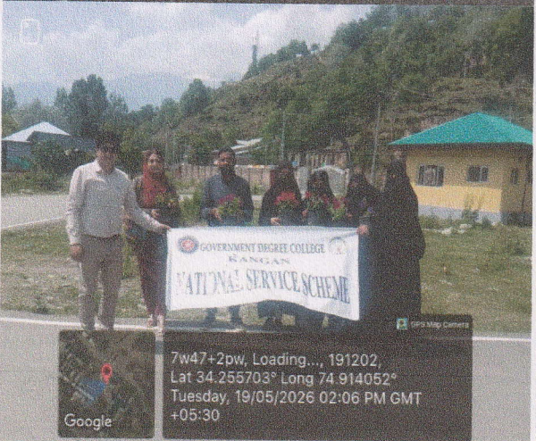
7w47+2pw, Loading..., 191202, Lat 34.255703° Long 74.914052° Tuesday, 19/05/2026 02:06 PM GMT +05:30