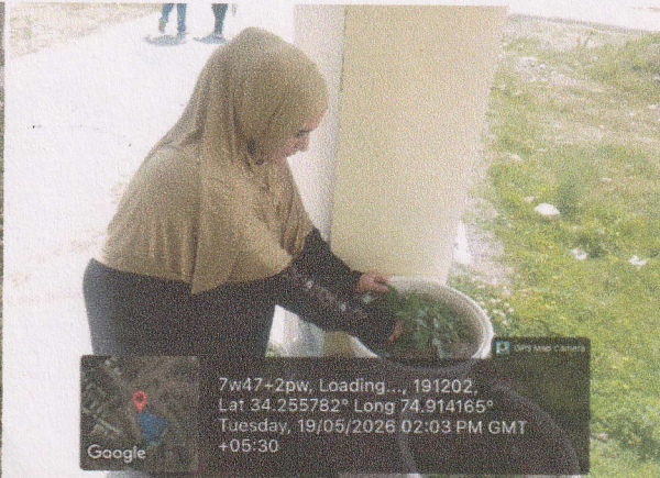
7w47+2pw, Loading..., 191202, Lat 34.255782° Long 74.914165° Tuesday, 19/05/2026 02:03 PM GMT +05:30