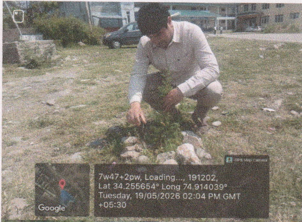
7w47+2pw, Loading..., 191202, Lat 34.255654° Long 74.914039° Tuesday, 19/05/2026 02:04 PM GMT +05:30