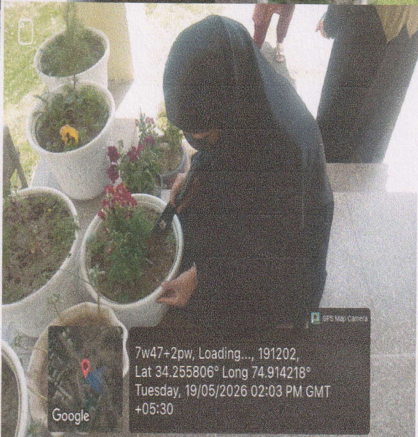
7w47+2pw, Loading..., 191202, Lat 34.255806° Long 74.914218° Tuesday, 19/05/2026 02:03 PM GMT +05:30