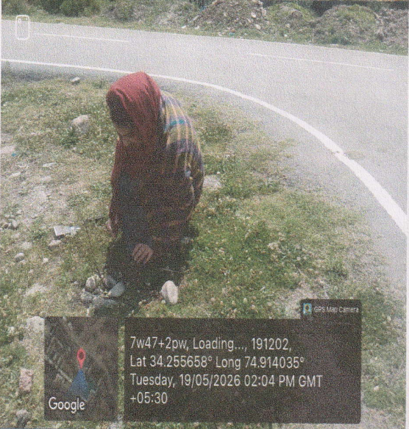
7w47+2pw, Loading..., 191202, Lat 34.255658° Long 74.914035° Tuesday, 19/05/2026 02:04 PM GMT +05:30