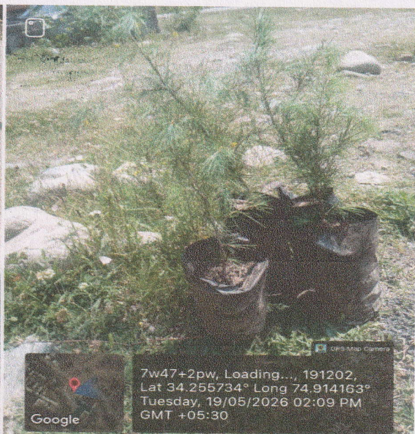
7w47+2pw, Loading..., 191202, Lat 34.255734° Long 74.914163° Tuesday, 19/05/2026 02:09 PM GMT +05:30