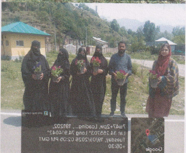
7w47+2pw, Loading..., 191202, Lat 34.255703° Long 74.914052° Tuesday, 19/05/2026 02:05 PM GMT +05:30

[Handwritten Signature] PRINCIPAL Govt. Degree College Copy to the Rangan